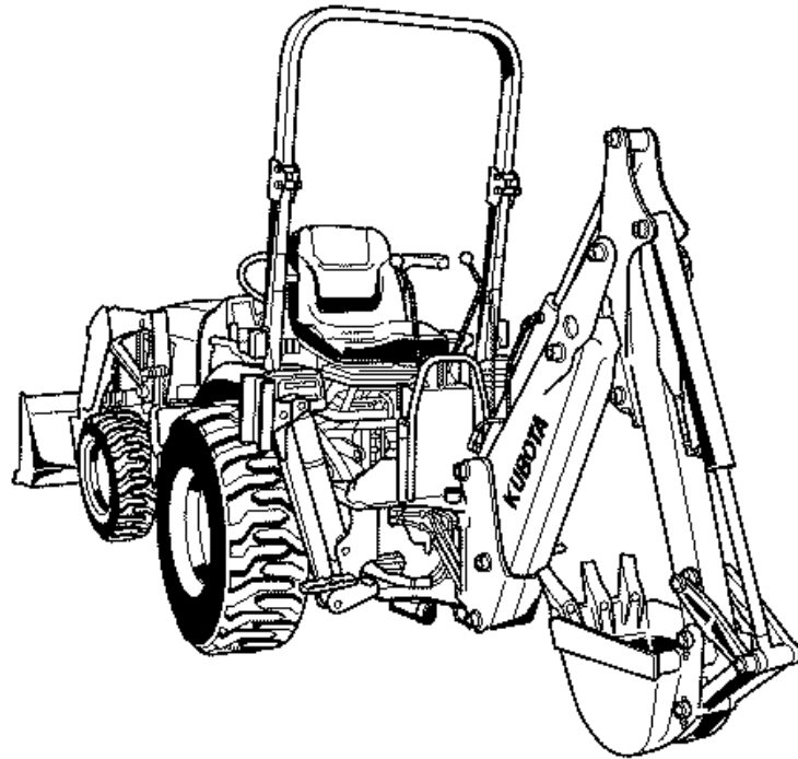
Figure Num BH65