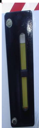
HYDRAULIC LEVEL SIGHT GAUGE

Always use the specified lubricant for the application and the region's seasonal temperatures. (See Section 23).