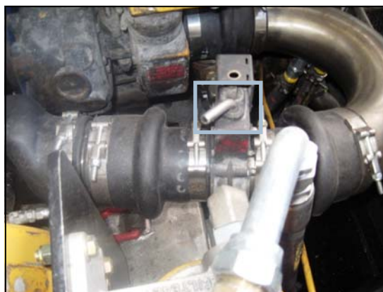
Emergency Intake Shut Off Valve Reset Lever

The valve is activated from the operator's compartment by a stop button which is pushed, once activated and the engine shuts down the valve will need to be reset before restarting. Ensure that the stop button has been pulled out and there is a reset lever down on the main body of the valve that will rotate and latch into the operating position. If the valve has not been reset the engine will not start. When the valve has been reset the engine can be started.