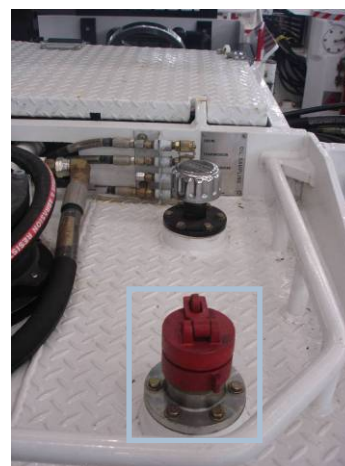
HYDRAULIC TANK FILL POINT