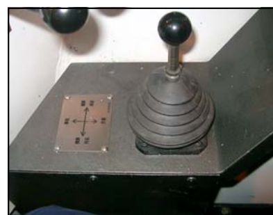
Four-Way Joystick Control Lever