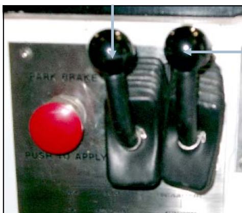
Two-Way Control Levers