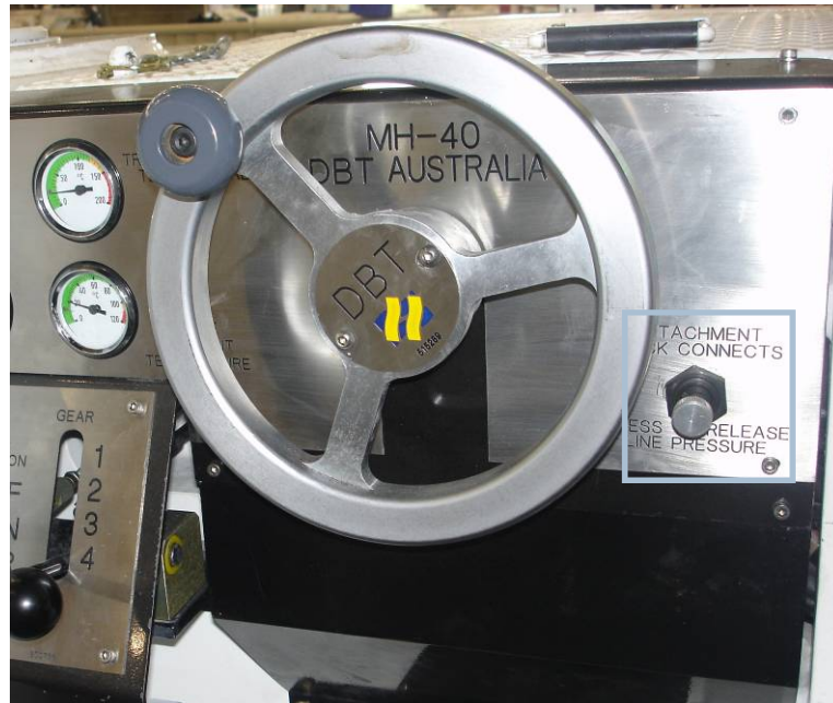
ATTACHMENT QUICK CONNECTS BUTTON

This button releases all of the pressure in the PTO lines to allow the couplings to be easily released. To release the pressure, release both of the two-way control levers to the hold position and press in the pressure release button for two seconds.