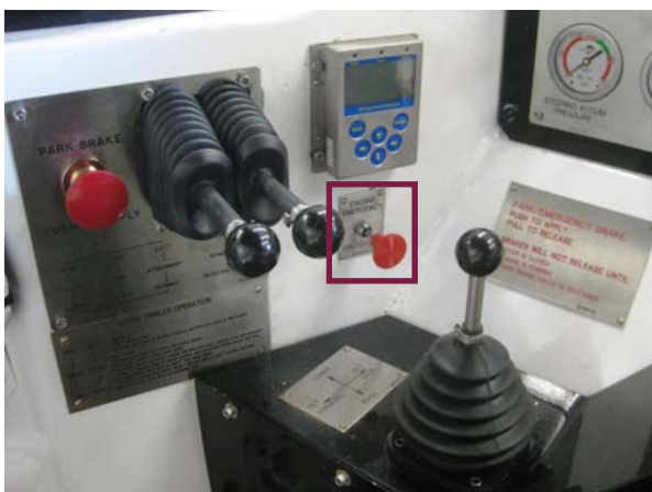
EMERGENCY INTAKE SHUT OFF VALVE STOP BUTTON

If the emergency intake shut off valve has been activated, the restarting of the engine should be done in compliance with the relevant regulations and Manager's Rules.