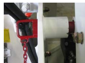
Lift Arm Locking Pin Installed