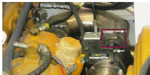
EMERGENCY INTAKE SHUT OFF VALVE RESET LEVER