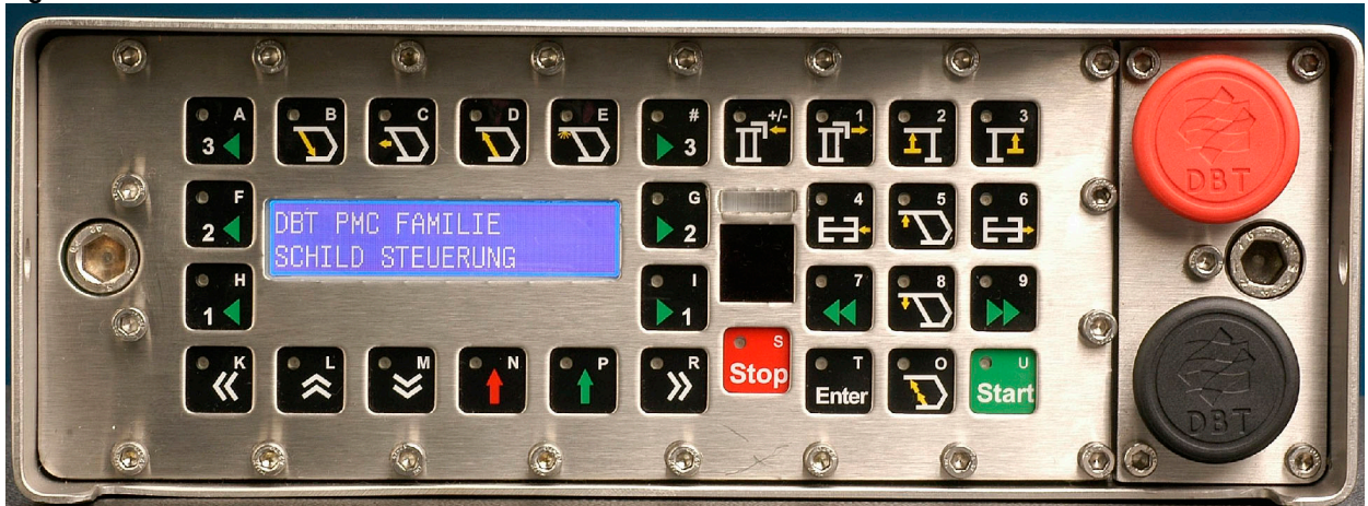
Fig. 11: Front view of the PMC ® -R

Every shield is equipped with a PMC ® -R - Shield Control Unit (SCU), which is the heart of the electrohydraulic control system. The single control system acquires measurement values such as pressure, movement and switch settings in its own shield. The PMC ® -R calculates from this data the required commands for the single shield- and automatic sequence functions, and allows them to be executed by the connected hydraulics valves. The PMC ® -R can control and display all functions of a shield and is, simultaneously, the interface between operator and machine. The PMC ® -R system can, based on a reliable network, control all individual shield functions. As an interactive system, it allows the user to execute single shield functions as well as automatic sequence functions. Important process values are continuously displayed as an acknowledgement for the operator.