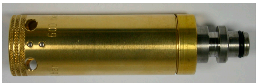
Fig. 22: Illustration of the pressure sensor